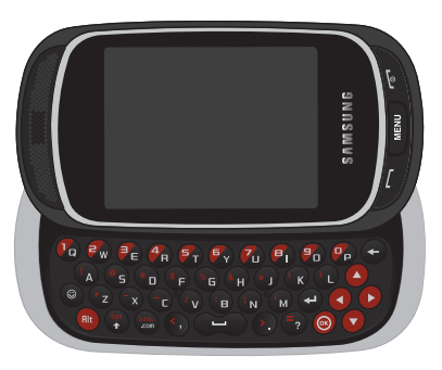
Create New Message Portrait Keypad